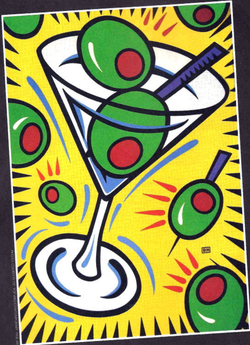
Be dazzled by Burton Morris's 'Pop Back into the future!' exhibition

must-do list | focus | luxe & less | locale